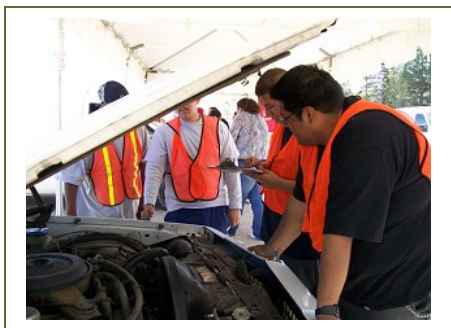
Bakersfield College Automotive Students performing preliminary diagnostics at the March 28, 2009 Bakersfield Tune In and Tune Up

The Central Valley is home to a large number of older vehicles, many of which are not registered and do not meet smog standards. These older out-of-tune vehicles can be assumed to be a potentially significant percentage of the unregulated air emissions in the Valley, and thus represents a prime opportunity for further emissions reductions. For the past six years, Valley CAN has sponsored a vehicles emissions clean-up program, Tune In & Tune Up, which incorporates a car-care clinic and health and safety fair to educate residents that much of the Valley's vehicle-related air pollution comes from older, out-of-tune vehicles. Vehicles are tested in minutes with a tailpipe emission testing device. If they are identified as high polluters, vehicle owners get a voucher for $500 in emission-related repairs or maintenance at a local Gold Shield certified automotive shop.