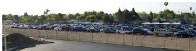
Bakersfield TTTU 3-28-09